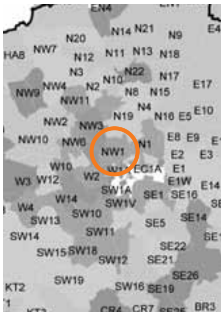
Weighted average weekly rent (£)

To use the map go to: www.london.gov.uk/rents/